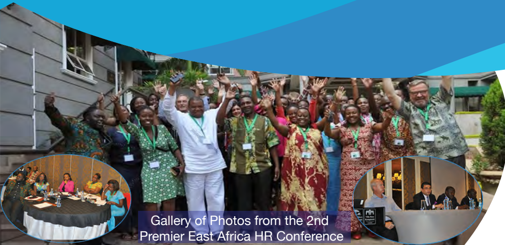
Gallery of Photos from the 2nd Premier East Africa HR Conference